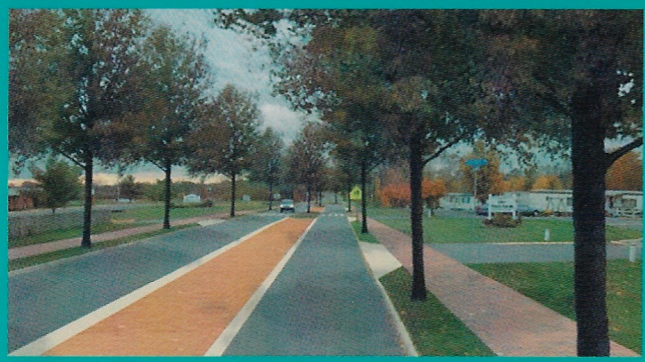
The concept above shows how the same view might look with The Catoctin Coalition's proposed improvements.