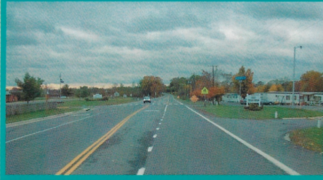
A view today of Route 15 at Lucketts, looking south.