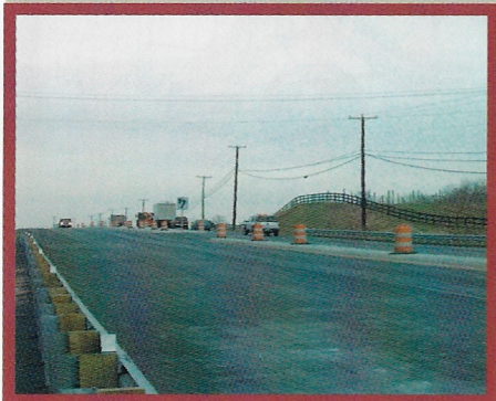
A view of a six-lane wide section of "improved" Virginia Byway, completed by VDOT at Big Spring.

We hope you will join us to ensure that future improvements to Route 15 are safe, scenic, and sensible.