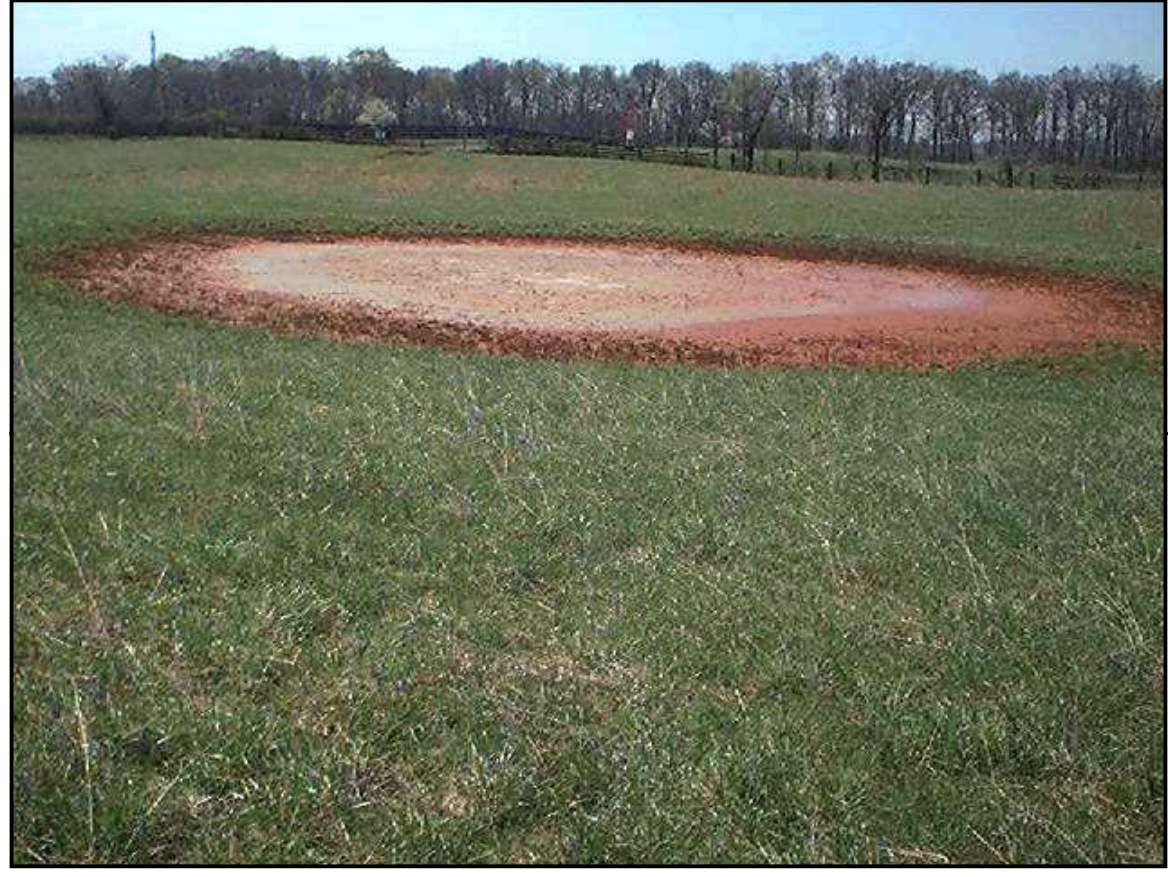
Selma Estates Subdivision (photograph date: April 14, 2003) An old sinkhole that has formed a clay plug and collects water.