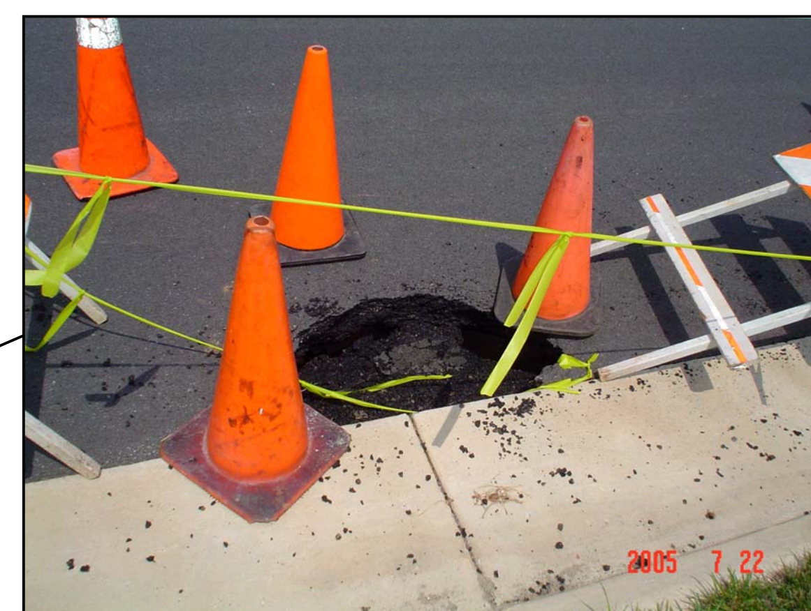
Route 15 Business near Dry Hollow Road (photograph date: July 22, 2005) Sinkhole is approximately 3 feet in diameter and 6 to 8 feet in depth.