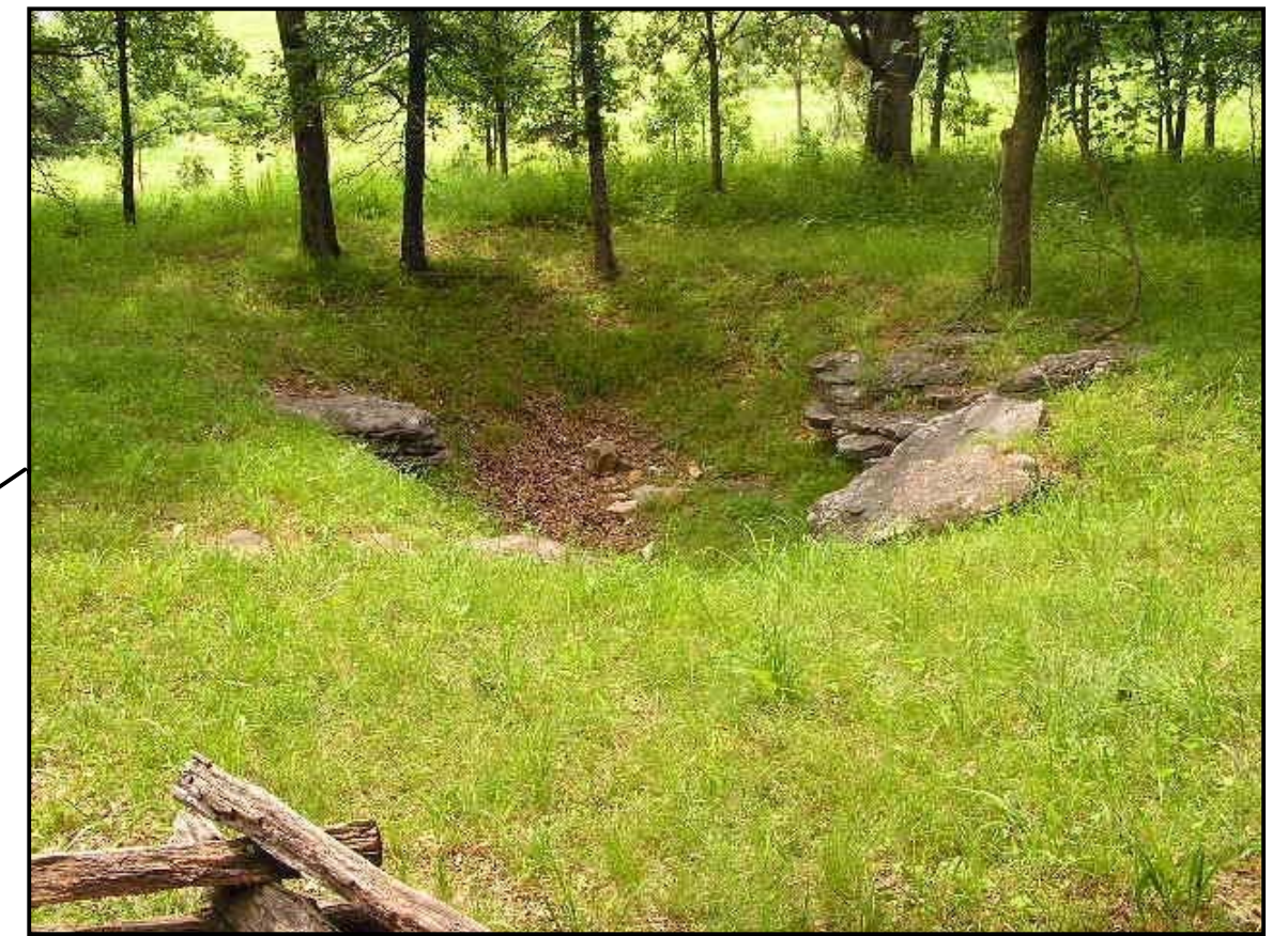
Morven Park Older sinkhole beginning to healover.