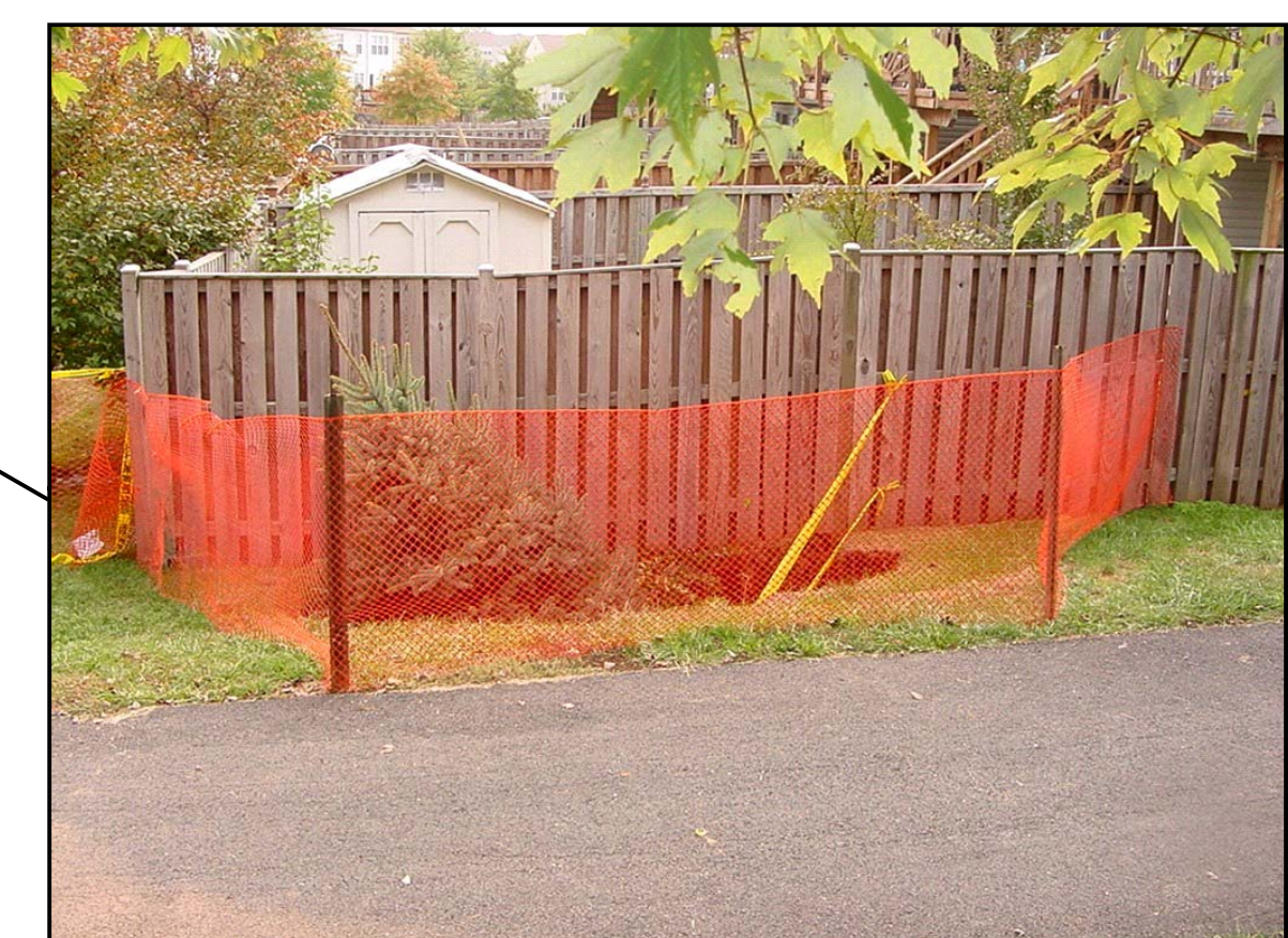
Exeter Subdivision (photograph date: January 10, 2002) The sinkhole opened around a 24-foot spruce tree (6 feet exposed).