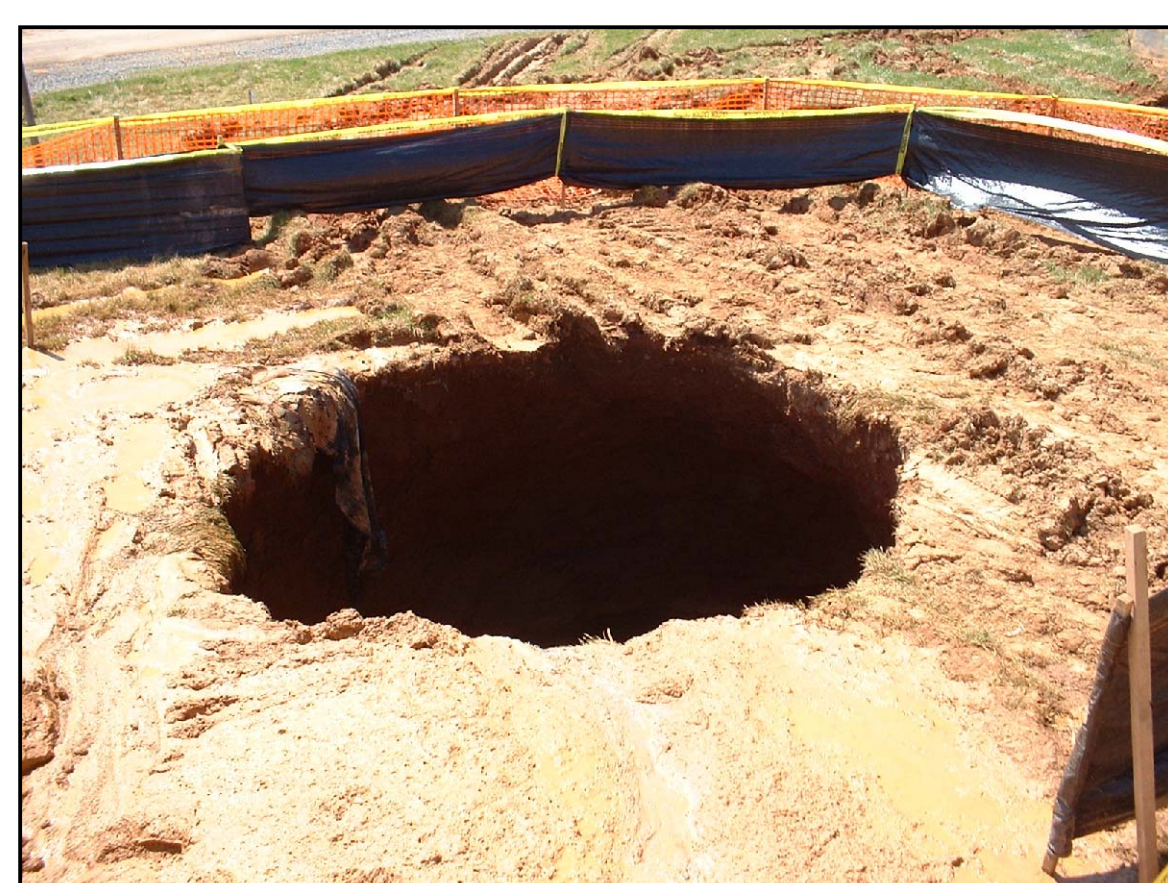
Leesburg Crossing Subdivision (photograph date: April 6, 2005) The sinkhole is approximately 8 feet in diameter and opened during well installation.