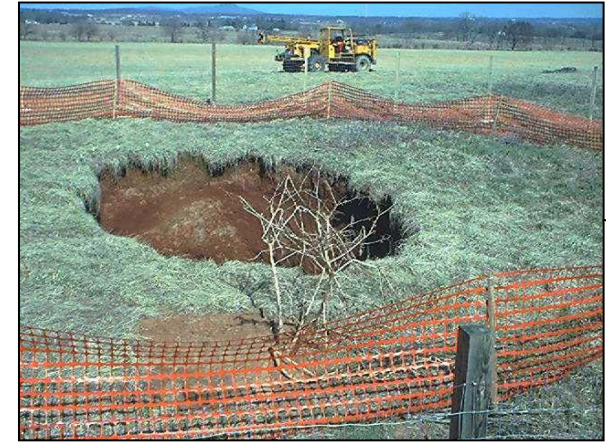
Selma Estates Subdivision (photograph date: March 27, 2003) The sinkhole is approximately 30 feet in diameter and 30 feet in depth and opened approximately 100 feet from a well being installed.