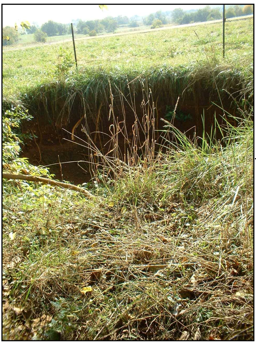
Raspberry Falls Subdivision (photograph date: October 18, 2004) The sinkhole is approximately 20 feet in diameter and 15 feet in depth.