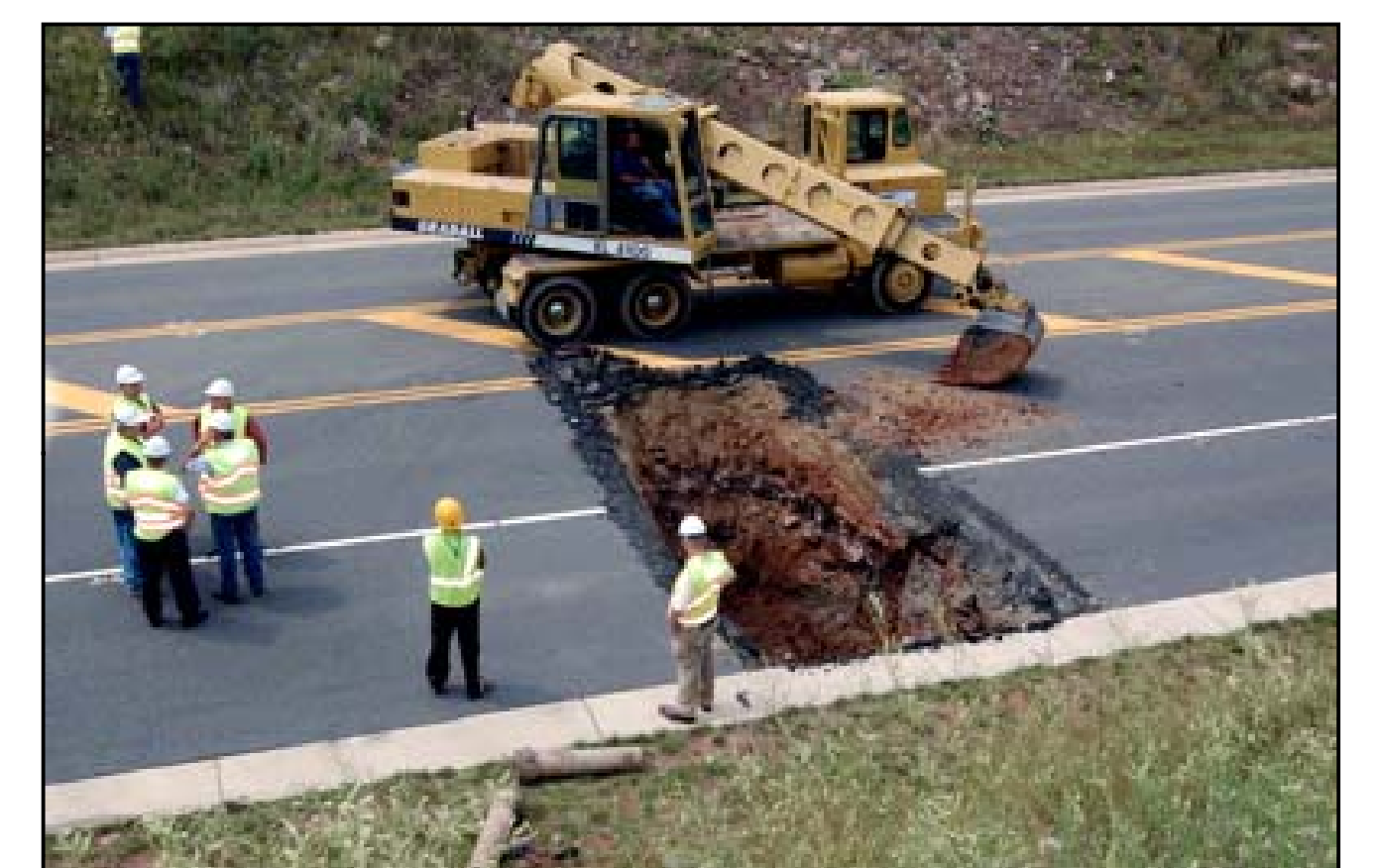
Approximately one year later, the sinkhole reopened at the same location. The sinkhole is approximately 20 feet in diameter and 15 to 18 feet in depth. (photograph date: June 28, 2006)