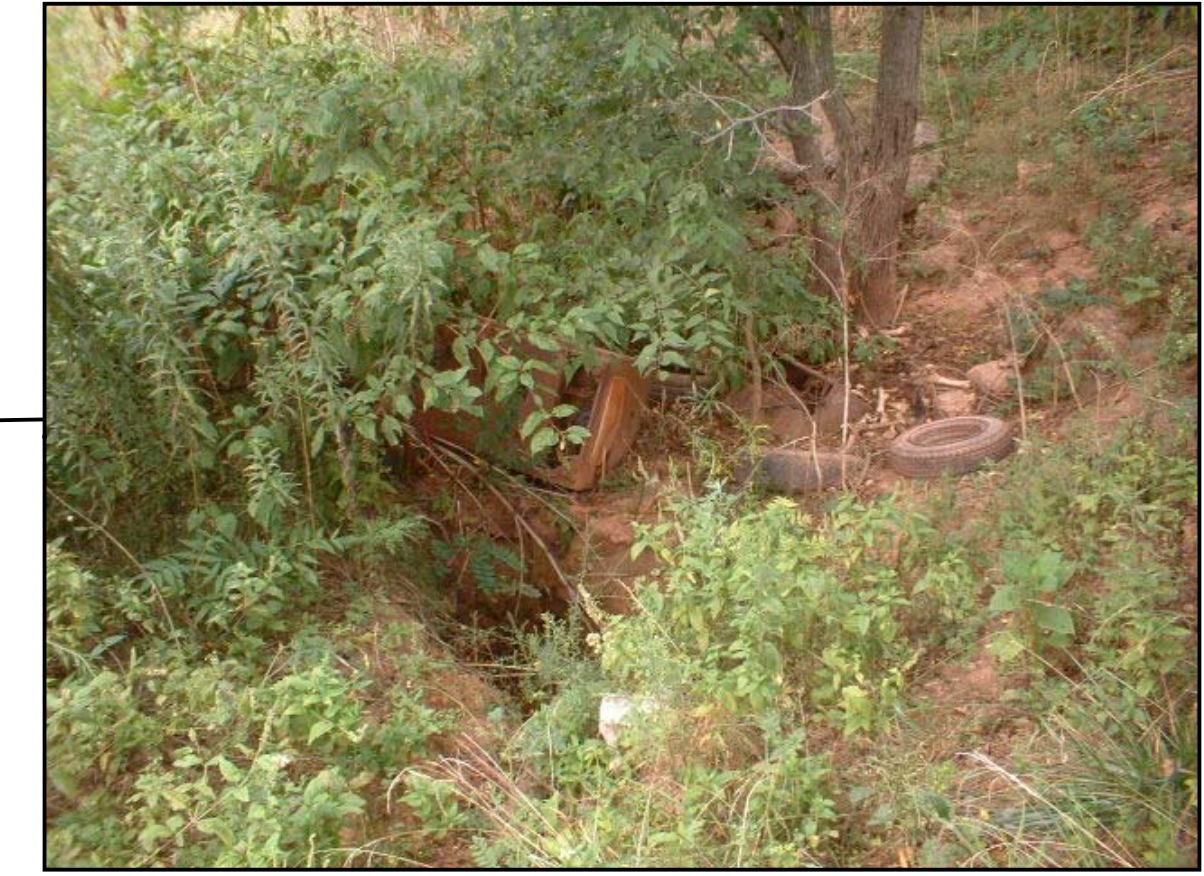
Zial Subdivision (photograph date: August 30, 2006) Sinkhole with debris. Sinkholes have historically been used as a location for trash/debris collection.